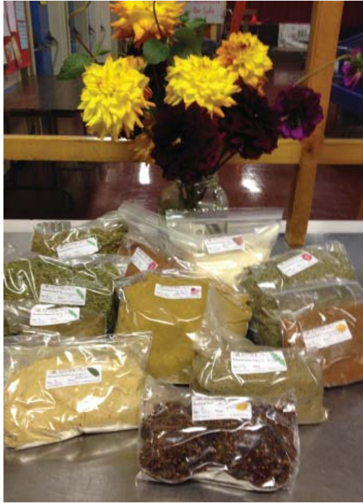
Herbs and spices from Sol Botanicals, a Village School family business with flowers from Holly's garden.