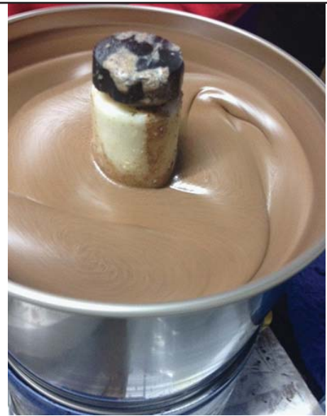
Velvety milk chocolate in the mélanger (a 48-hour process)