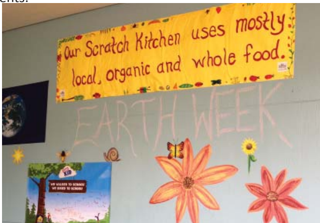
Please see page 4 for more pictures from Earth Week!