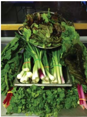
Local, organic bounty served this week in The Village School Kitchen!