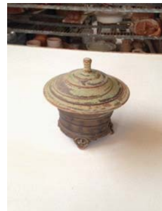
An altar jar, or repurpose as a salt cellar

In addition, we’ll have tempting handcrafted pieces such as iShare glass straws and Daniels Family Pottery for sale. Buy a lovely one-of-a-kind altar jar; the supply is limited, so shop early.