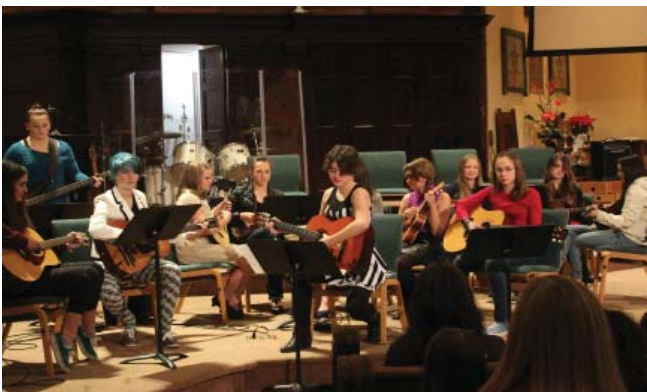
8th Grade Guitars