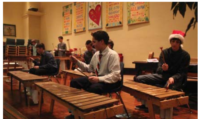
8th Grade Marimbas