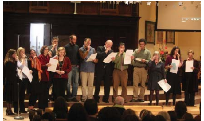
Village School Staff