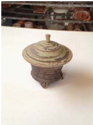
An altar jar or repurpose as a salt cellar

In addition, we'll have tempting handcrafted pieces such as iShare glass straws and Daniels Family Pottery for sale. Buy a lovely one-of-a-kind altar jar; the supply is limited, so shop early.