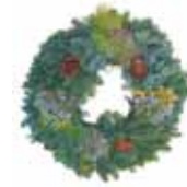
An 8th Grade Fundraiser

Help us fundraise for the 8th grade class trip by purchasing a beautiful wreath made with the freshest greens from the Pacific Northwest. Starting with a Noble Fir base, generous clusters of Berried Juniper, and splashes of Incense Cedar, ~a wonderful welcome for your home. Wreath finished outside diameter 22" - 24".