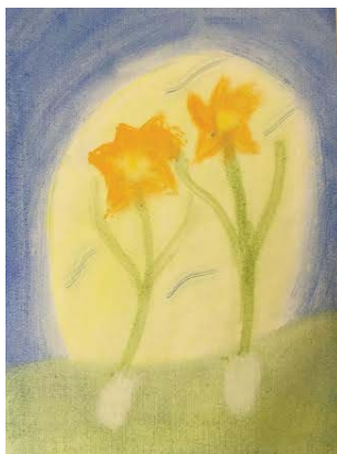
3rd Grade Artist