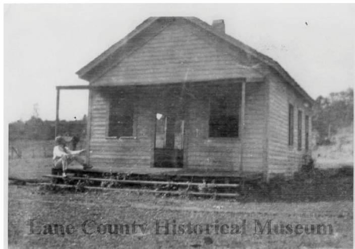
The original Dunn School, located at what is now 3411 Willamette Street was built in 1868.

Long before we move the school, we need to sort through all the things we've collected over the years. If anyone is interested in helping with small organizing projects at the current site, please contact the office.