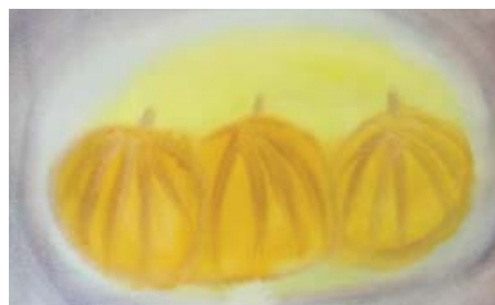
3rd Grade Artist