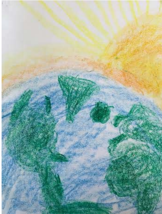
3rd Grade Artist

Village Care, Village School's after school care program will be creating a quiet and cozy space for the after care children. They are seeking donations for the following: a clean carpet, bean bags, small chairs, a small table, and a small book shelf. And any arts and crafts materials (esp. paper and paints) are also welcome! Please leave deliveries next to the cabinets in the NW part of the cafeteria. The Village Care Team is most grateful and appreciative for any donations of these items!